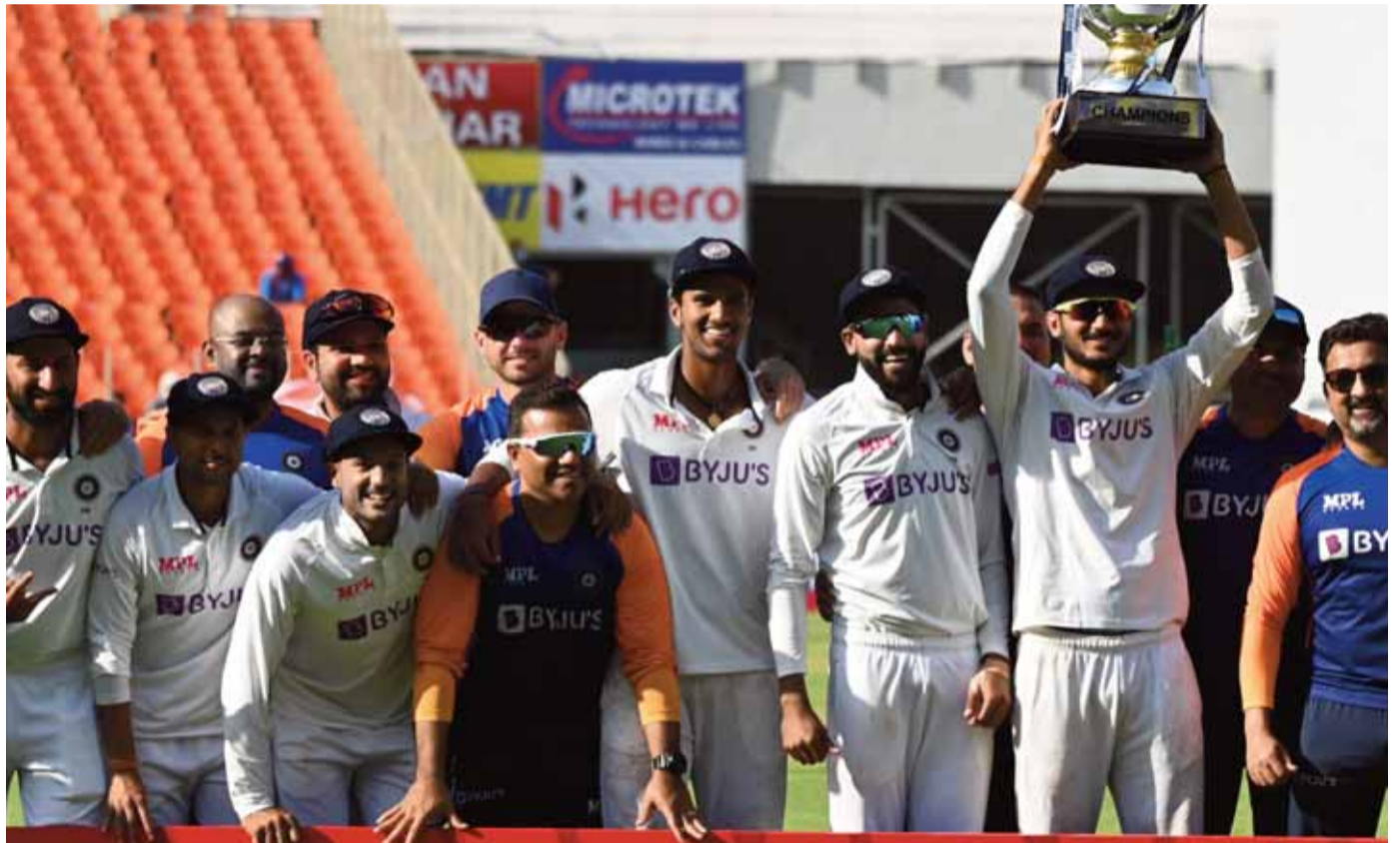
AHMEDABAD: Indian players and team officials pose with the trophy after winning the test series against England at the end of their fourth Test cricket match at the Narendra Modi Stadium in Motera yesterday.

Patel got opener Dom Sibley for three and then Ben Stokes for two after the left-hand batsman miscued a sweep and was caught at leg gully by Kohli. Ashwin took the prized scalp of skipper Joe Root for 30 to virtually end England's hopes.