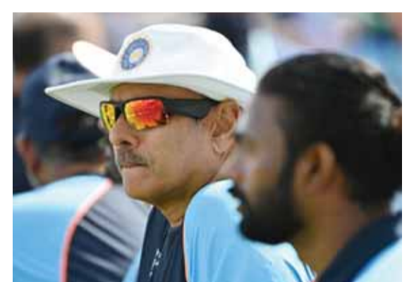
NOTTINGHAM: In this file photo taken on August 4, 2021 India's head coach Ravi Shastri looks on ahead of play on the first day of the first cricket Test match of the India Tour of England 2021 between England and India at the Trent Bridge cricket ground in Nottingham. — AFP

The 29-year-old Rahul has also had one demerit point added to his disciplinary record for a first offence in a 24-month period. Rahul admitted the offence and accepted the sanction proposed by ICC match referee Chris Broad, the former England batsman, which meant there was no need for a formal hearing. — AFP