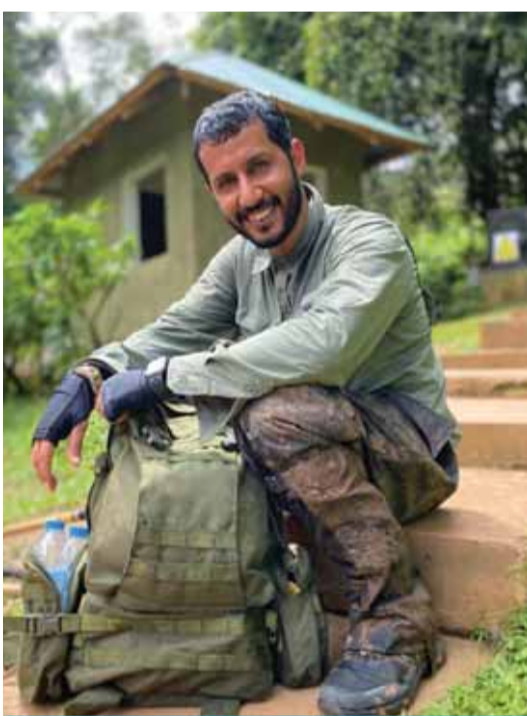
Kuwaiti photographer Majed Al-Zaabi.