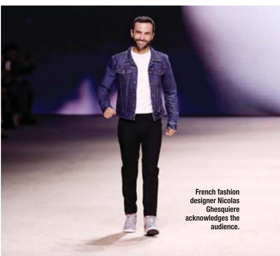
French fashion designer Nicolas Ghesquiere acknowledges the audience.