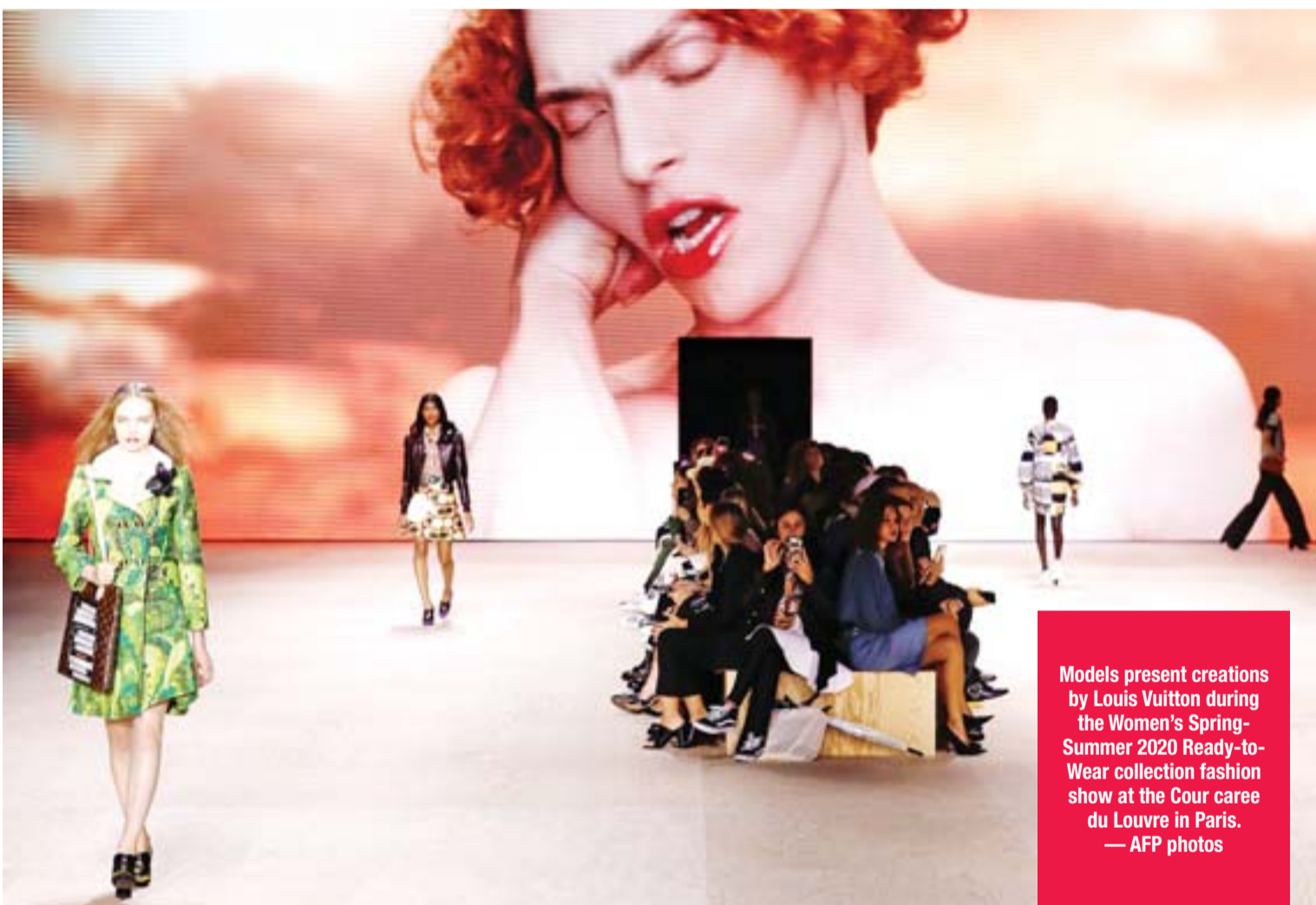
Models present creations by Louis Vuitton during the Women's Spring-Summer 2020 Ready-to-Wear collection fashion show at the Cour carree du Louvre in Paris.

Louis Vuitton showcased on Tuesday a collection that mixed fashion inspirations, colors and patterns for the last show of the Paris Fashion Week. Nicolas Ghesquiere, the artistic director of Vuitton's women's collections, set the runway extravaganza in makeshift space inside a courtyard of the Louvre museum, with show business power couple Justin Timberlake and Jessica Biel in the front row as well as actors Jennifer Connelly and Justin Theroux.