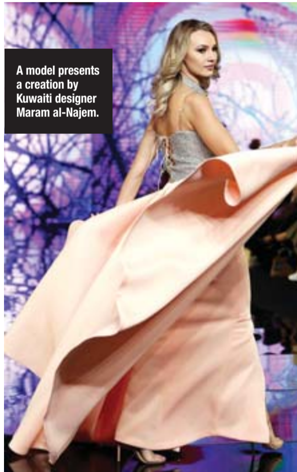
A model presents a creation by Kuwaiti designer Maram al-Najem.