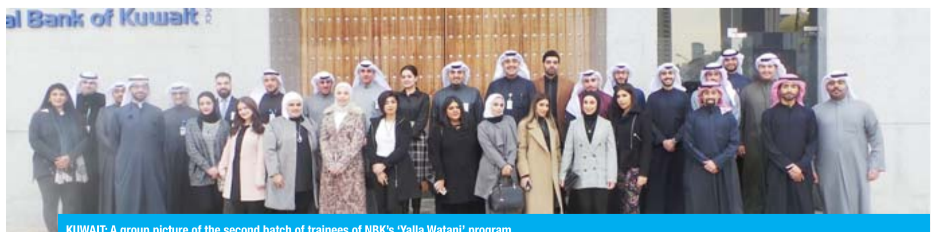
KUWAIT: A group picture of the second batch of trainees of NBK's 'Yalla Watani' program.

Throughout the program, unique sets of skills will be enhanced in order to improve performance, increase self-confidence, adapt to change and promote innovation. The program also caters for soft