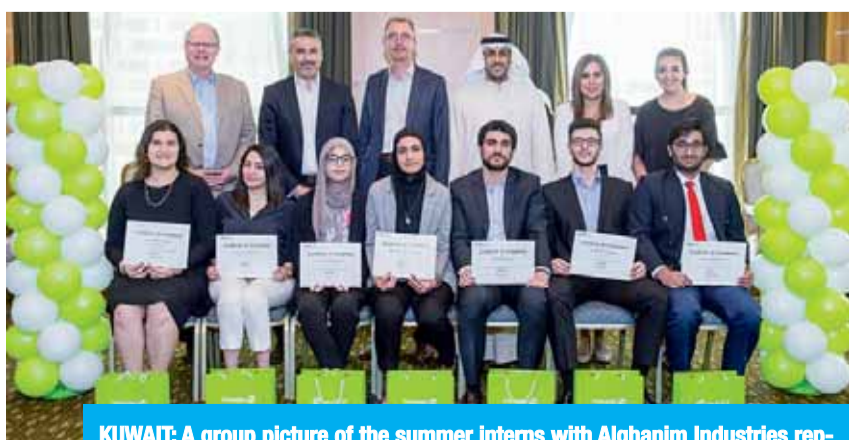
KUWAIT: A group picture of the summer interns with Alghanim Industries representatives.

Alghanim Industries has a long record of accomplishment working with established entities to empower youth and develop their skills, such as INJAZ Kuwait and AMIDEAST, who contribute extensively to help different segments of society with a number of programs and initiatives.