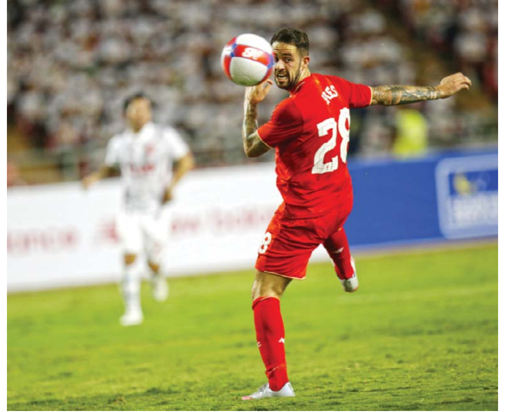
BANGKOK: Liverpool's Danny Ings jumps for the ball during their friendly soccer match against Thailand All Stars, at Rajamangala national stadium.

New man Origi must have thought he would never make it four with the ball hitting the woodwork twice and a yards out shot denied by a remarkable save from the Thai goalkeeper.