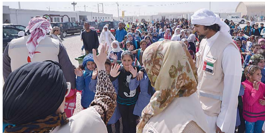
Her Highness Sheikhha Jawaher bint Mohammed Al Qasimi during her visit to one of the refugee camps.

The KNPC has a moral duty to pay compensation for victims' families despite not being legally responsible for accidents that happen to contracted workers, the sources said. Separately, two workers sustained severe leg injuries in an accident at a boats harbor used by the Kuwait Oil Company (KOC) in the Ahmadi refinery. —Al-Rai