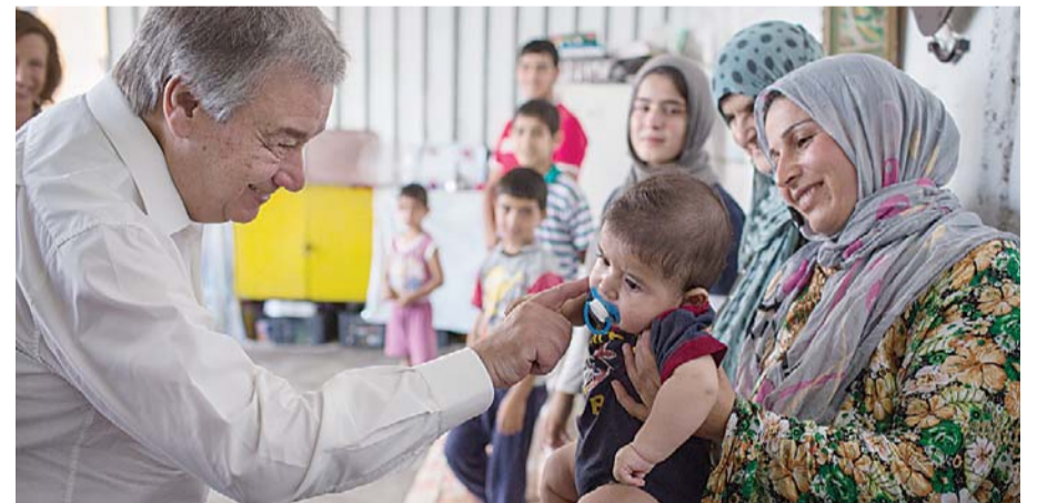
Antonio Guterres during his visit to one of the refugee camps.